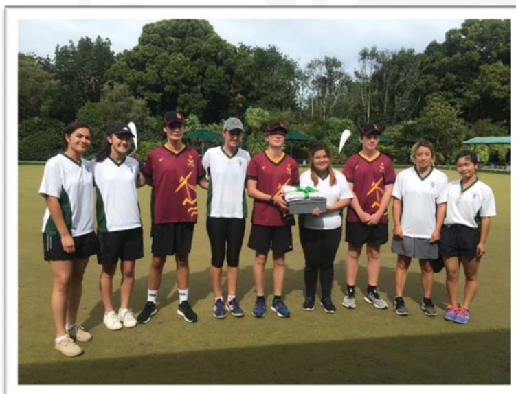
Lawn bowlers present the Cloth and box of hearts to Cashmere Highschool players.

"I want to thank St Dominic's College for their thoughtfulness and kindness for putting together the notes and the mural of thoughts and messages of kindness following last week's tragic events. We appreciate your thoughts and prayers in what is a tough time for Cashmere High School, and the wider Christchurch community. I myself the 'Bowls Coach' work as a doctor at Christchurch Hospital and was incredibly touched by your thoughts. We look forward to catching up at the 2020 bowls nationals."