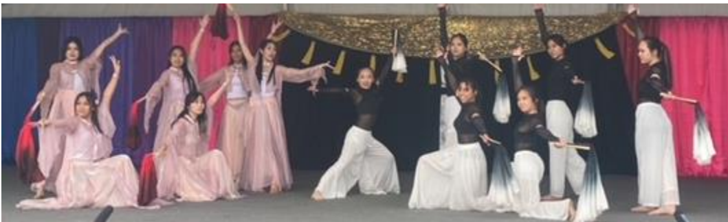
Chinese - 1st place Chinese and 1st for overall choreography on Diversity stage

Samoan - 3rd place Maulu'ulu, 3rd place Sasa, 3rd place Pese, 3rd place Exit.