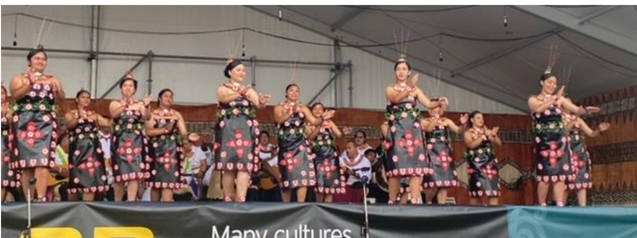
Tongan - 3rd place Tauluga