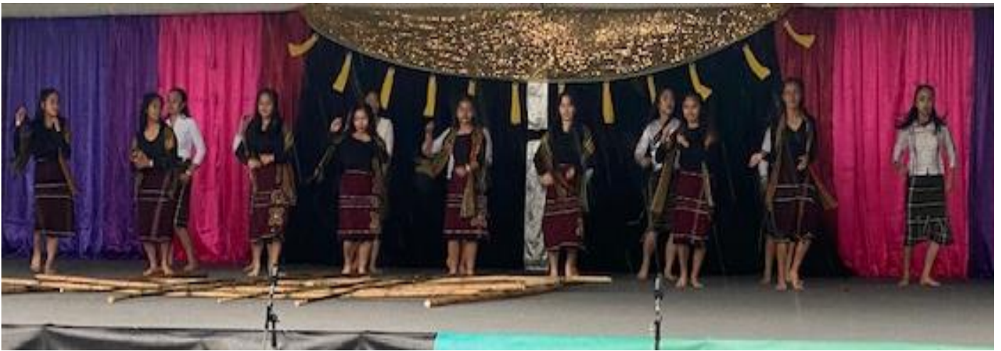
Burmese Group – First ever Burmese group to be represented at Polyfest.