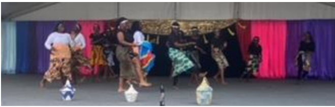
African 2nd place African